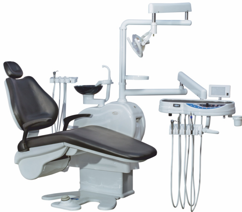
BIO-JET-10 BASE-LESS DENTAL CHAIR MOUNT UNIT