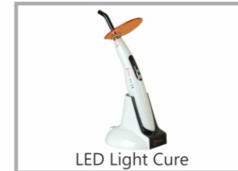
LED Light Cure