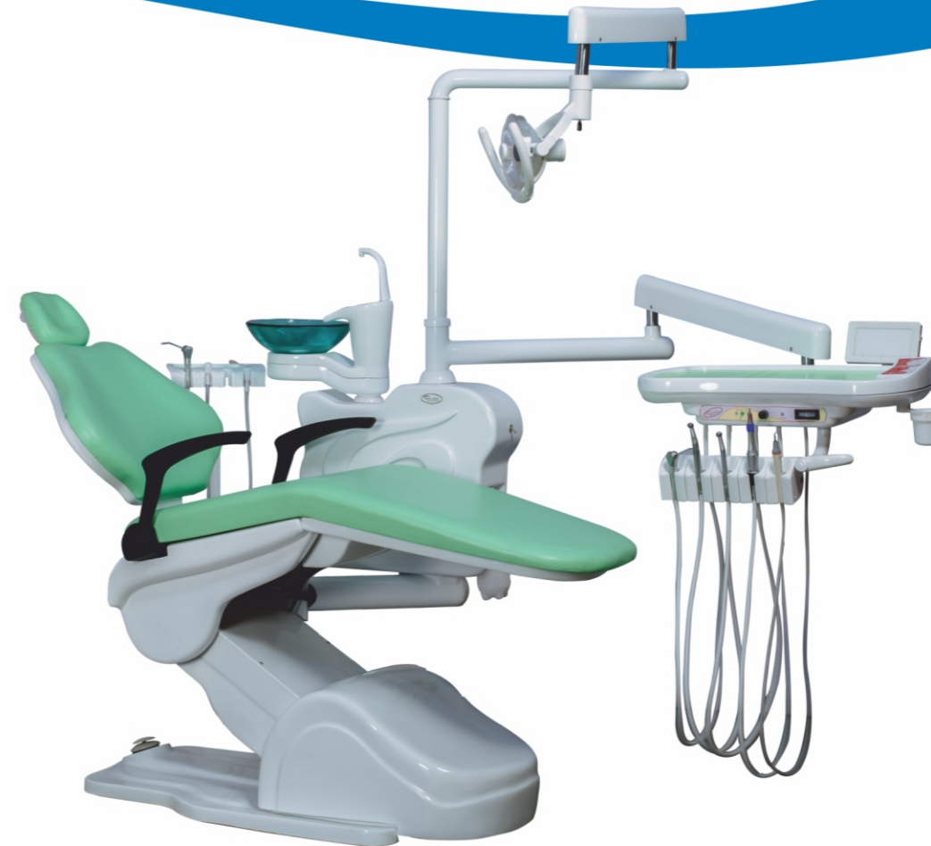
BIO-ELANTRA DENTAL CHAIR MOUNT UNIT