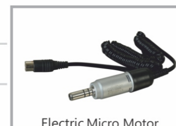
Electric Micro Motor